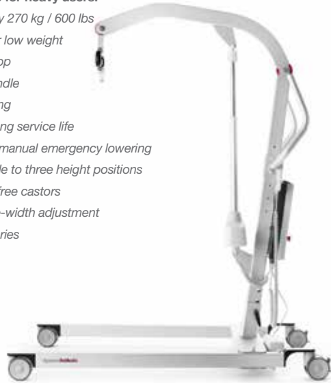
Eva600EE complies with requirements for Class 1-products in the European Medical Device Directive MDD/92/43/EEC.