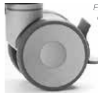
Encapsulated dual wheels.

Support , for mobility. Lifting , both manual and mechanical.